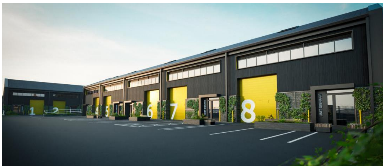
Figure 3: Proposed innovation units to be built at Oceansgate, Devonport, by Plymouth City Council.

Plymouth City Council's next phase of Oceansgate development will deliver a place for marine businesses to innovate and collaborate. A planning application was submitted in September proposing the construction of two buildings providing over 1,700m 2 of high-quality workspace within eight units expanding the existing Oceansgate complex, which is already home to 14 industrial units and 12 offices.