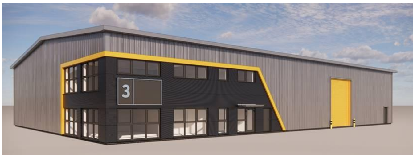
Figure 4: Architectural rendering of Unit 3, Beaumont Way, Langage. © Plymouth City Council

A seed capital grant of £4m has also been allocated to Plymouth City Council for a second construction project. This direct development of a Plymouth City Council owned plot of approximately 1.6 hectares (4 acres) is located on part of the PASD Freeport's Langage Tax Site. The scheme has full planning consent (South Hams District Council ref no. 4441/21/ARM) for the development of approximately 4,615m 2 (50,000ft 2 ) of sustainable, high quality employment accommodation for medium and large sized businesses to occupy.