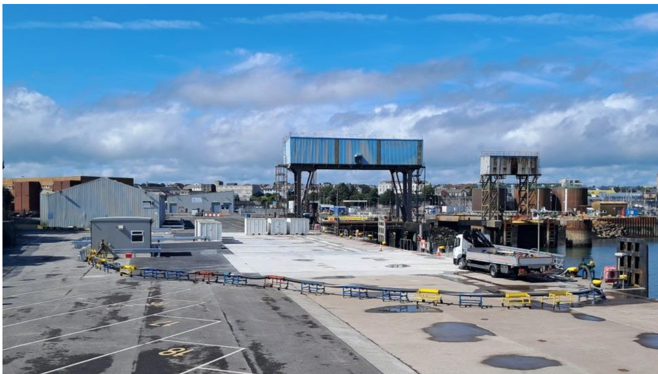
Figure 1: West Wharf, Millbay, following reinforcement works carried out between December 2023 and September 2024.

Construction began in December 2023 and involved the installation of 30 steel tubular piles, which means that the West Wharf now has a 60-metre section capable of accommodating 100-tonne cranes, and therefore significantly increasing the load capacity of the berth. The enhancement will enable the