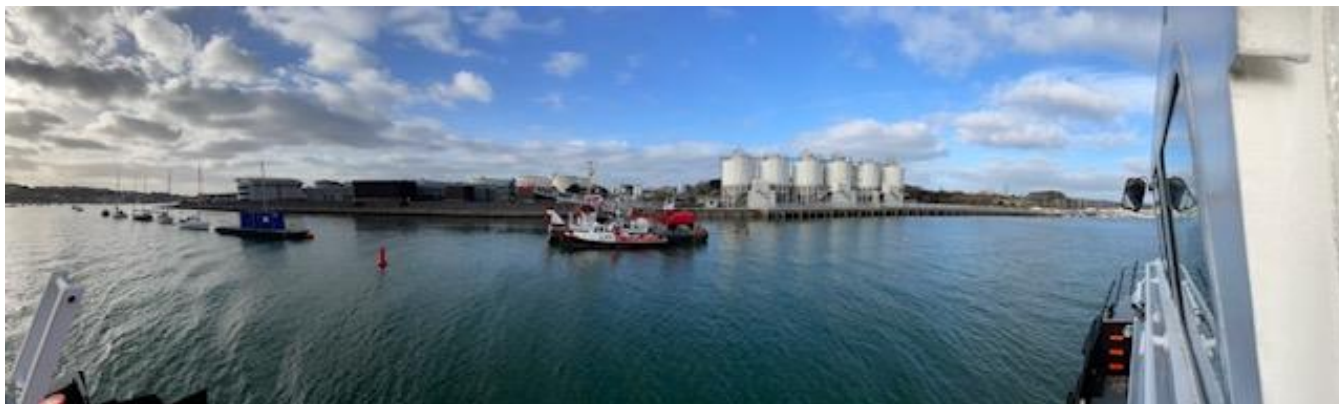
Figure 2: Section of the Cattewater channel to be widened to accommodate larger, greener vessels.

PASD Freeport has also worked closely with Cattewater Harbour Commissioners over the past year in support of a port optimisation project to provide safe navigational channels for slightly larger hulls, supporting commitments set out in the Freeport's Full Business Case to futureproof port facilities for new markets and support further development of more regular short sea shipping routes.